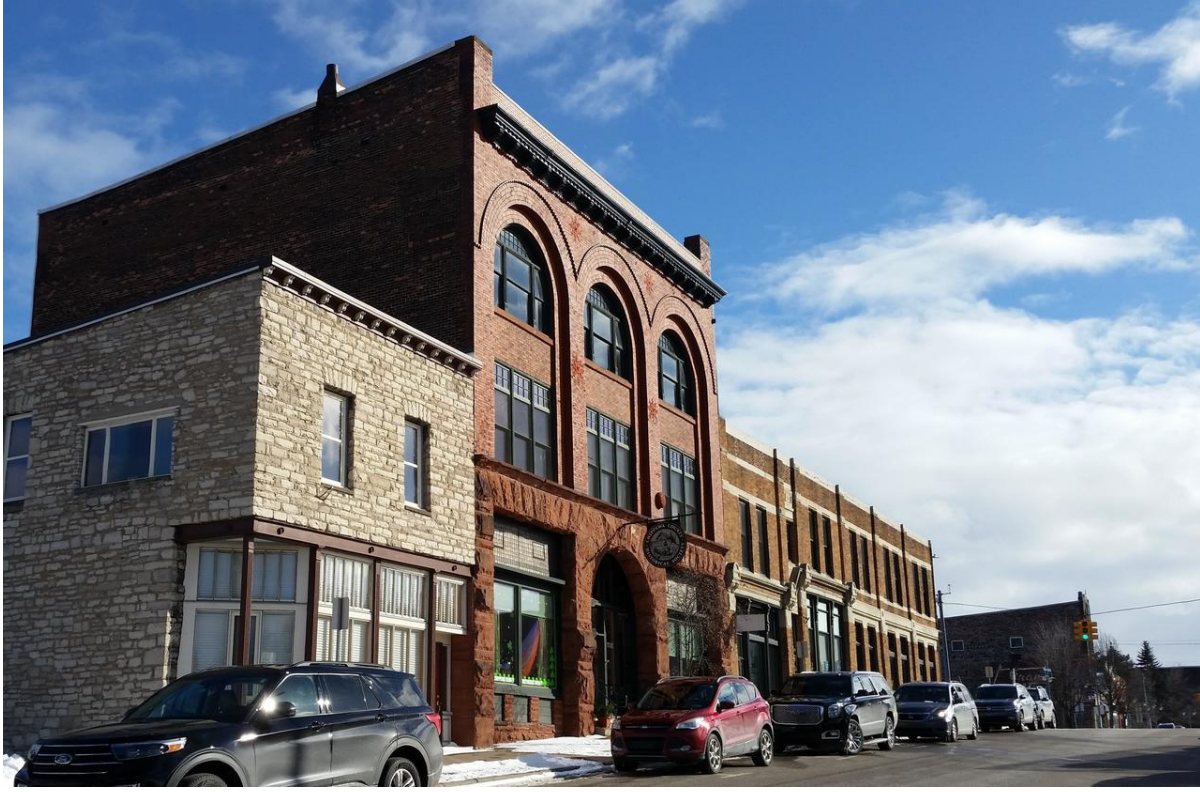
Downtown Sault Ste. Marie.