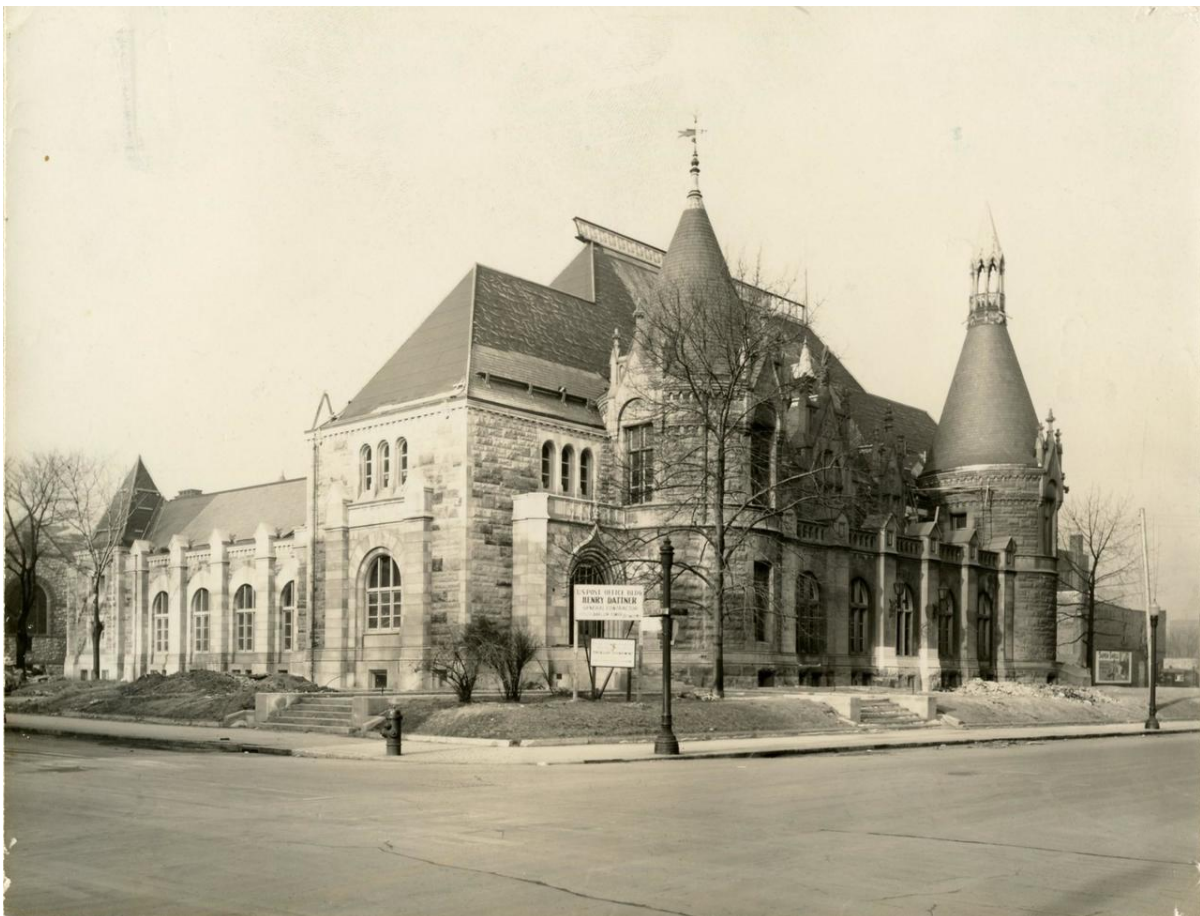
1898 Saginaw Post Office as seen in 1937. From the session, "An Endless Story: Saving and Preserving Saginaw's Castle Building," to be presented on Thursday, May 15, 1:30 p.m. – 2:30 p.m.

For the complete abstracts describing these presentations and the names and bios of presenters, visit the MHPN's conference landing page at: www.mhpn.org/conference . Conference attendees can mix-and-match track sessions and activities.