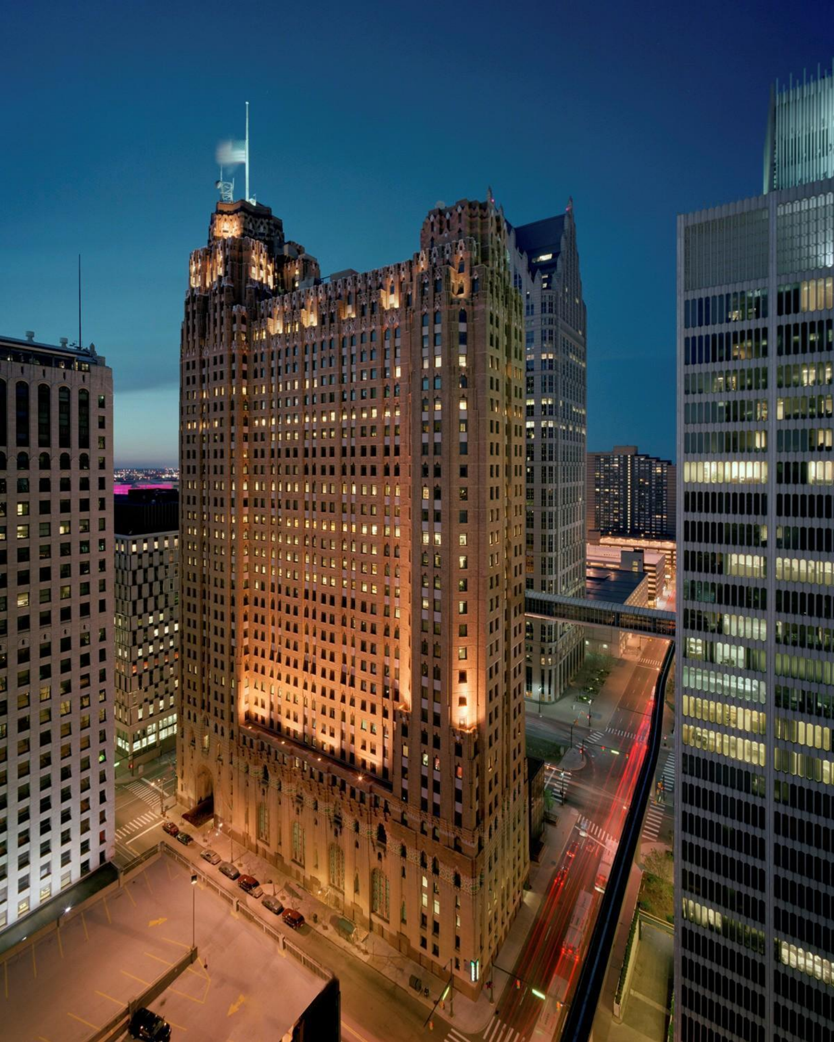
1929 Guardian Building, renovation complete. From the session, "Restoring a National Landmark – Detroit's Guardian Building," presented Friday, May 16, 2:15 PM - 3:30 PM.