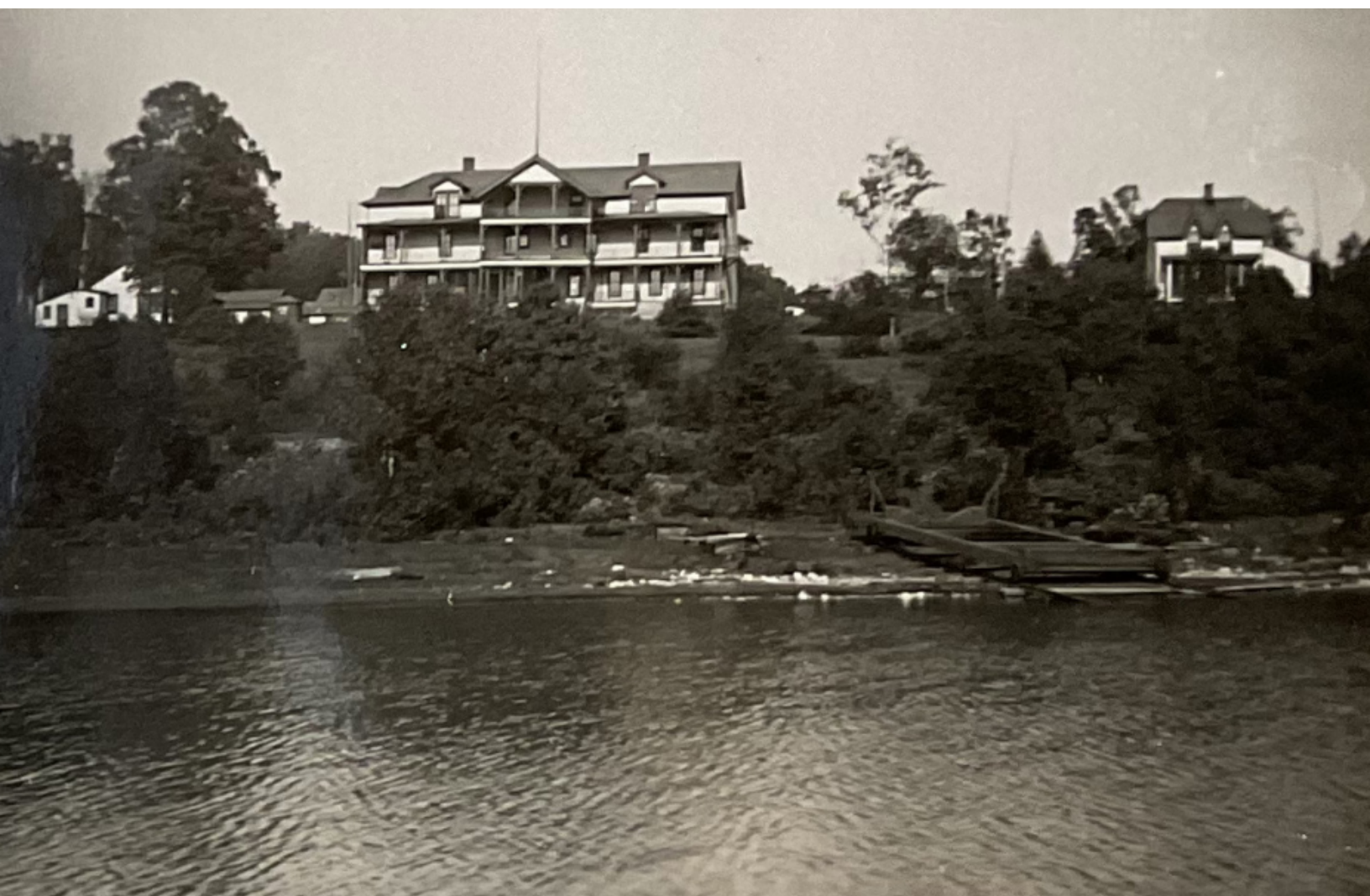
Circa 1890 St. Marys Club Resort Hotel, Lime Island. From the session, "Historic Insights and Future Directions: A Study of Recreation and Industry on Lime Island," presented on Friday, May 16, 10:00 AM – 11:30 AM.