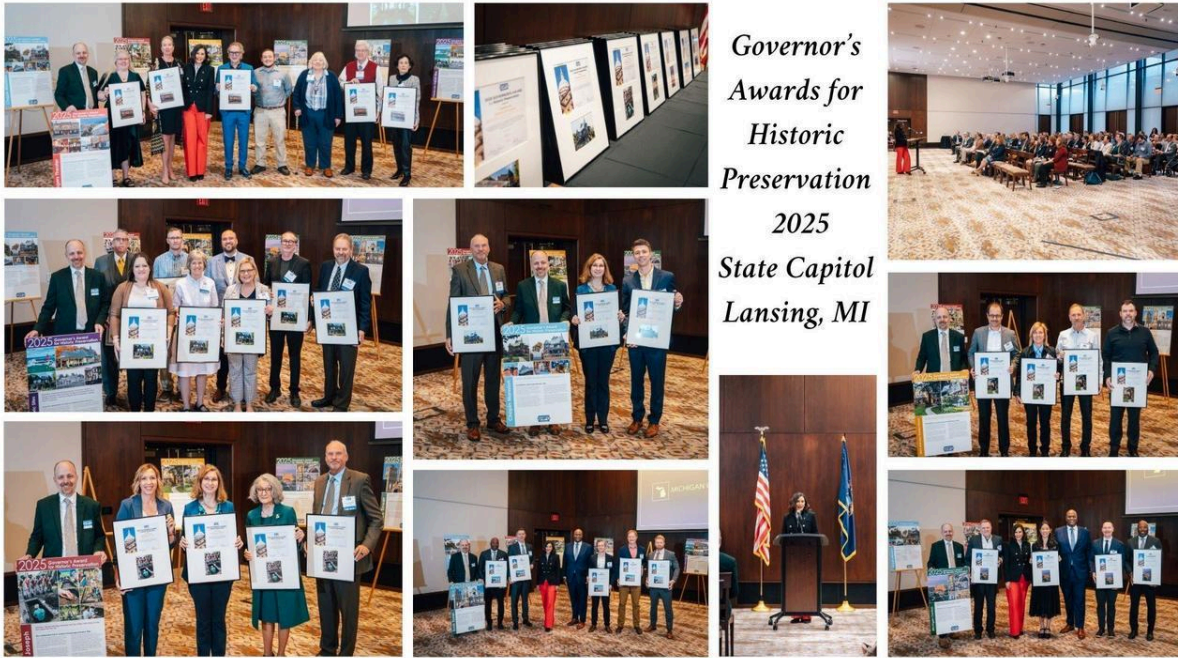
Governor's Awards for Historic Preservation.