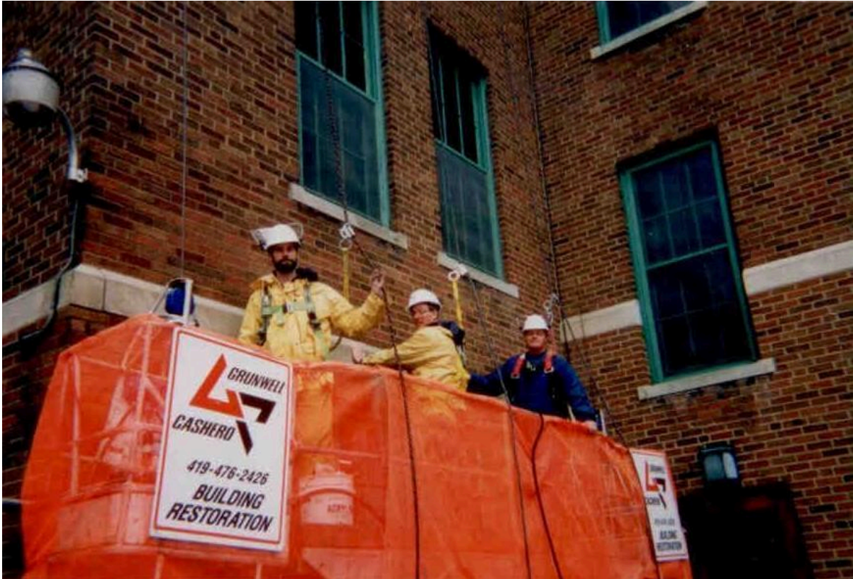
A check on tuck-pointing at the first Trades Symposium.