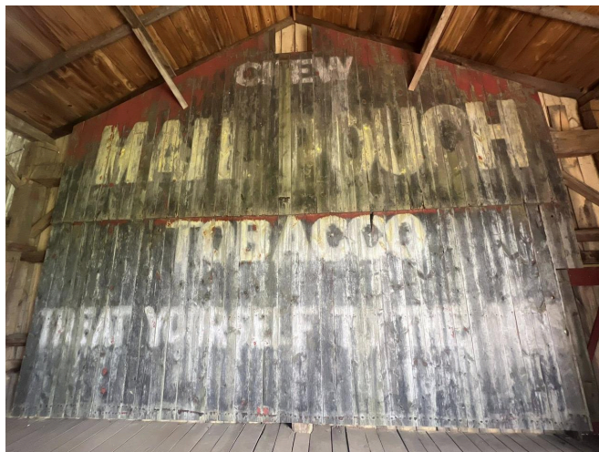
Mail Pouch Tobacco signs in Hillsdale County.

Access the survey here: https://bit.ly/4mv8BZY .