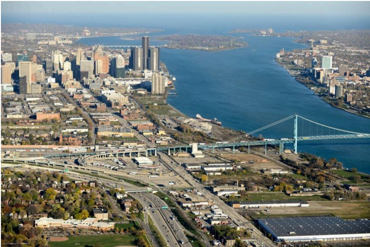
Photo Caption: Looking eastward to Detroit, Belle Isle, out Jefferson Avenue, the Grosse Pointes, Lake St. Clair.

We were pleased to announce in the Soo that we are returning to the Detroit Area on May 5-7, 2026, for the MHPN's 46th Annual Statewide Preservation Conference! We will be at the Edsel & Eleanor Ford House in Grosse Pointe Shores, headquartered in its beautifully designed Visitor Center. Our working theme is "Enduring Distinction."