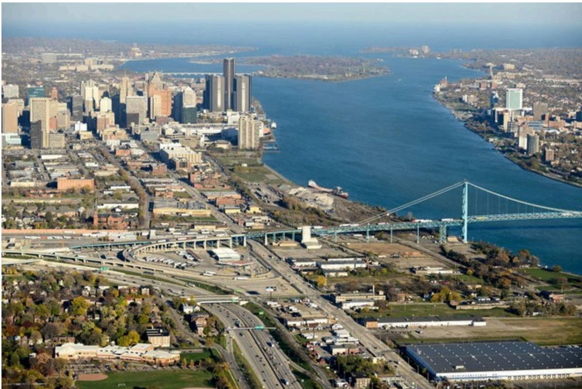
Looking eastward to Detroit, Belle Isle, Jefferson Avenue, the Grosse Pointes, and Lake St. Clair.

MHPN supports the sustainability and economic viability of Michigan's historic places through advocacy, education, and direct action.