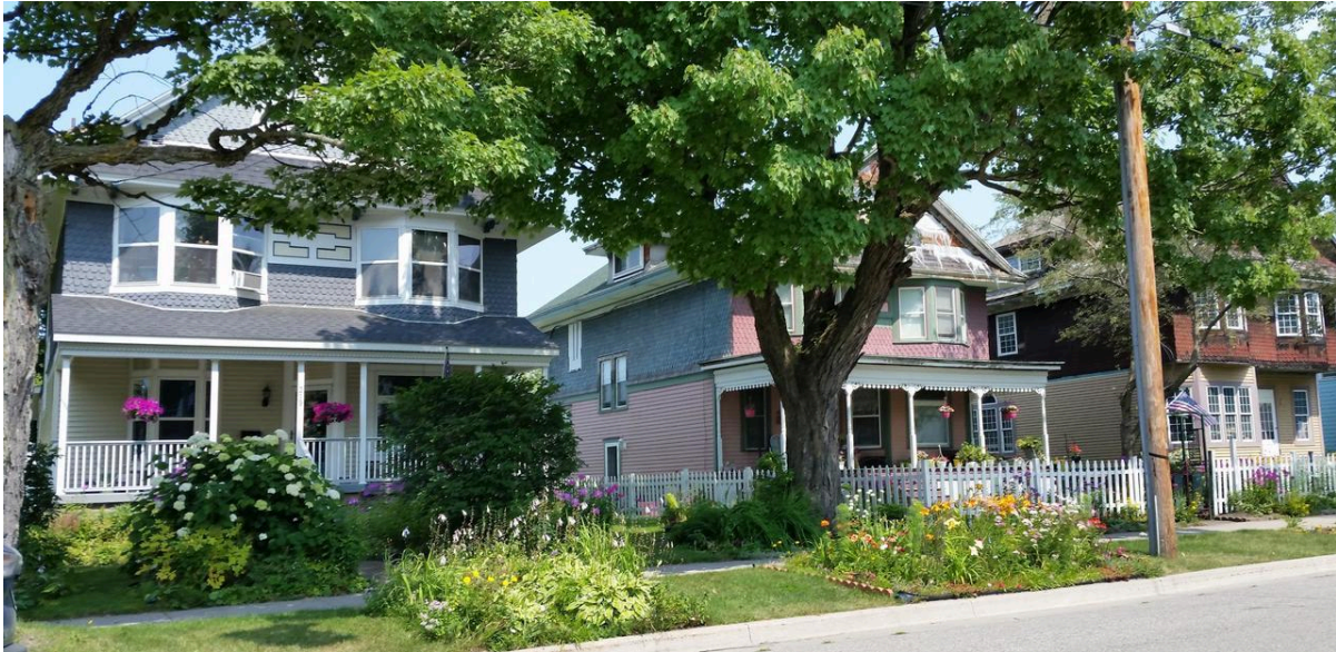
Maple Street is one of Sault Ste. Marie's beautiful residential districts. MHPN enjoyed being in the Soo for the 45th annual conference in May.

The Four Star Theatre is not a finished project – the inside is more complete than the exterior and an MEDC award has just been announced for marquee repair. But its doors already are open to an increasingly full schedule. This is a rebirth you shouldn't miss!