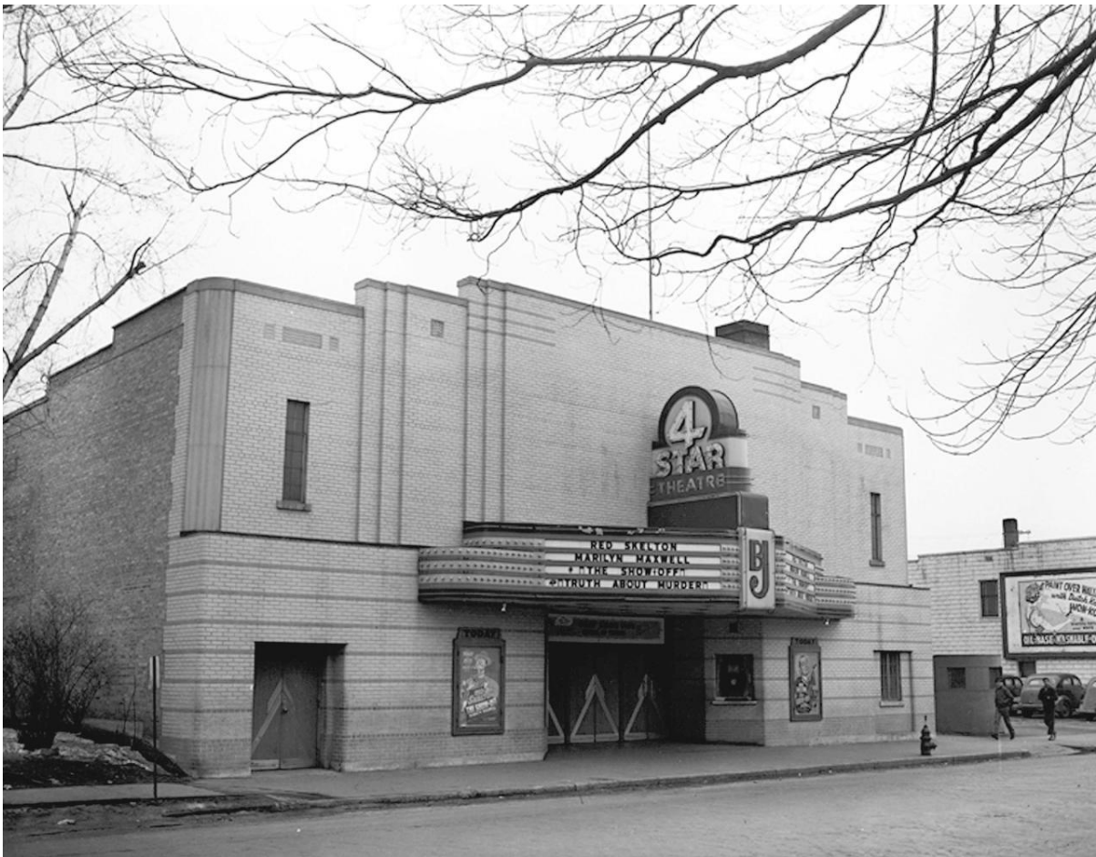
MHPN's 2025 Fall Benefit will take place at The Four Star Theatre, pictured here in 1946, in Grand Rapids.

MHPN supports the sustainability and economic viability of Michigan's historic places through advocacy, education, and direct action.