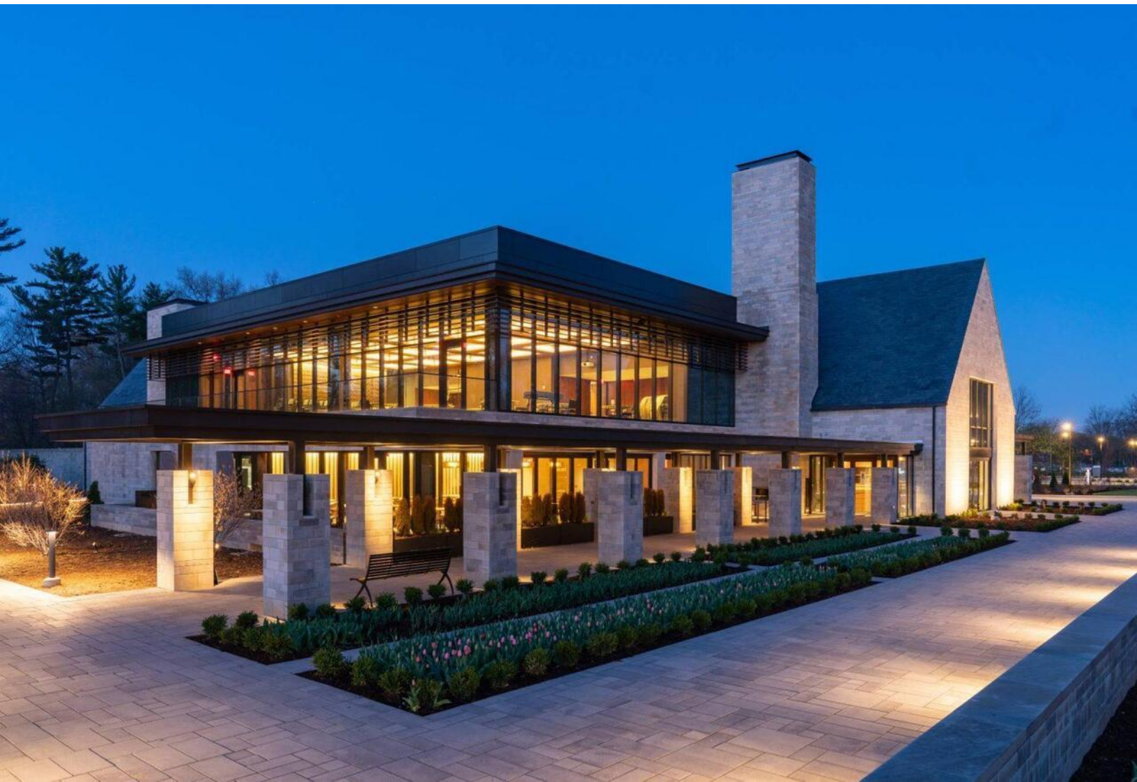
Edsel & Eleanor Ford House Visitor Center.