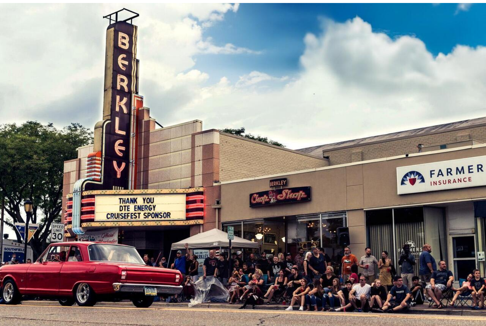
The 2026 annual conference is focused on the Detroit Metro Area that includes over 200 cities surrounding Detroit. Pictured here is Downtown Berkley, but other cities will come up during in-seat sessions and tours – Southfield, the Grosse Pointes, Huntington Woods, Ferndale, Dearborn, Royal Oak, and others.

Will you help? Visit our website's donation page to make an online gift . Choose "Year-End Solicitation" as your designation. Or send your check made payable to "MHPN" at 313 E. Cesar E. Chavez Ave., Lansing, MI 48906. Don't consider this one more year-end gift. Consider it your first investment in 2026!