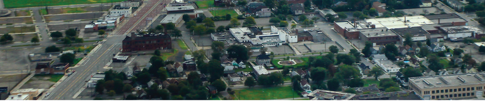
Aerial view eastward from Detroit to Lake St. Clair.